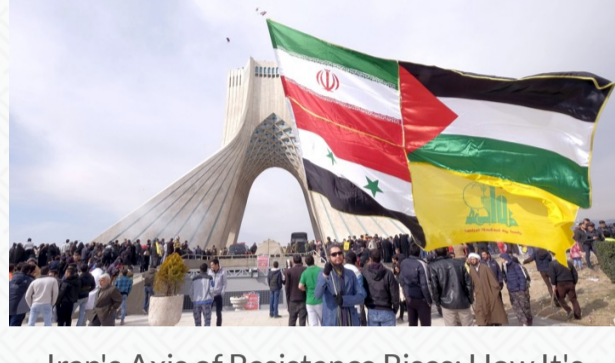
Iran's Axis of Resistance Rises: How It's Forging a New Middle East

Payam Mohseni and Hussein Kalout, Foreign Affairs