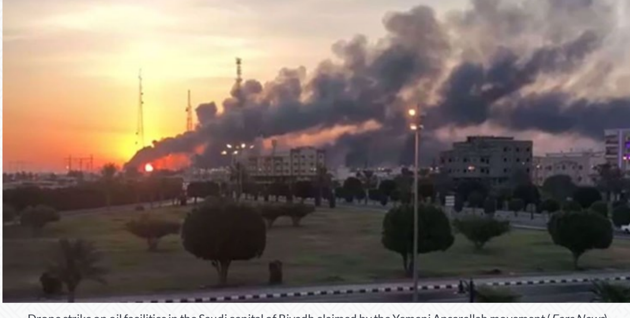
Drone strike on oil facilities in the Saudi capital of Riyadh claimed by the Yemeni Ansarallah movement.