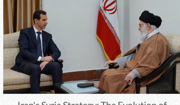
Iran's Syria Strategy: The Evolution of Deterrence.

While general rivalry between Iran and Israel has been on the rise in recent years, the past few weeks have seen heightened direct military confrontations and covert operations between the two states as the United States seeks to potentially re-enter the nuclear deal and indirect Iran-U.S. negotiations have resumed in Vienna. For a background understanding and primer on these recent escalations between Israel and Iran in the Middle East, see the two publications below by affiliates of the Project on Shi'ism and Global Affairs explaining Iran's forward deterrence posture in "Iran's Syria Strategy: The Evolution of Deterrence" ( International Affairs ) and the changing geopolitical landscape of the region with the strengthening of Iran and its allies in "Iran's Axis of Resistance Rises" ( Foreign Affairs ).